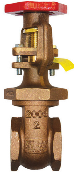
2" OS&Y GATE