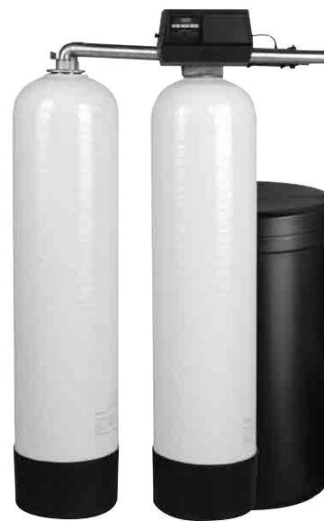
Series PWS15T Twin Alternating