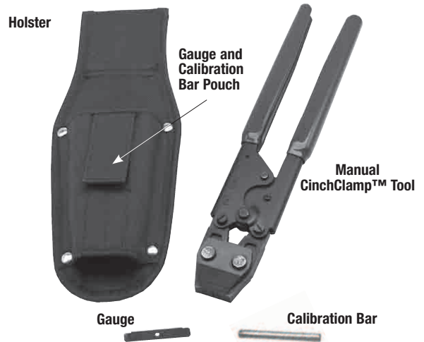
Manual CinchClamp™ Tool with work pouch and calibration gauge. Calibration gauge and calibration bar are located in side pouch.

Do not use the Manual CinchClamp Tool to remove CinchClamps. This will cause damage to the tool, resulting in improper connections.