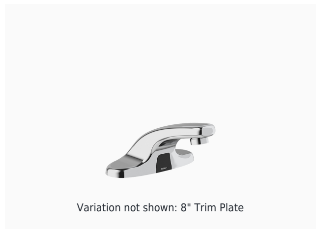
Variation not shown: 8" Trim Plate