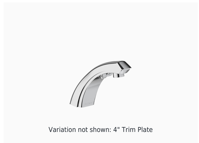
Variation not shown: 4" Trim Plate