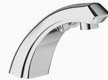
Variation not shown: 4" Trim Plate