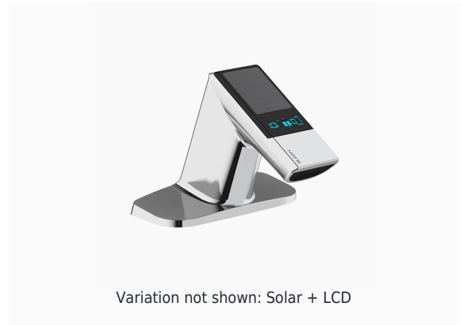
Variation not shown: Solar + LCD