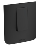
Matte Black (MB)