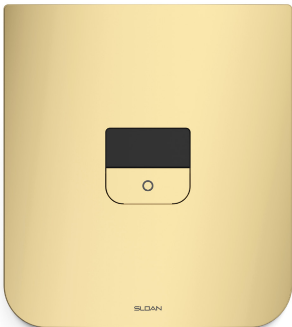
Polished Brass (PVDPB)