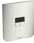
Brushed Nickel (BN)