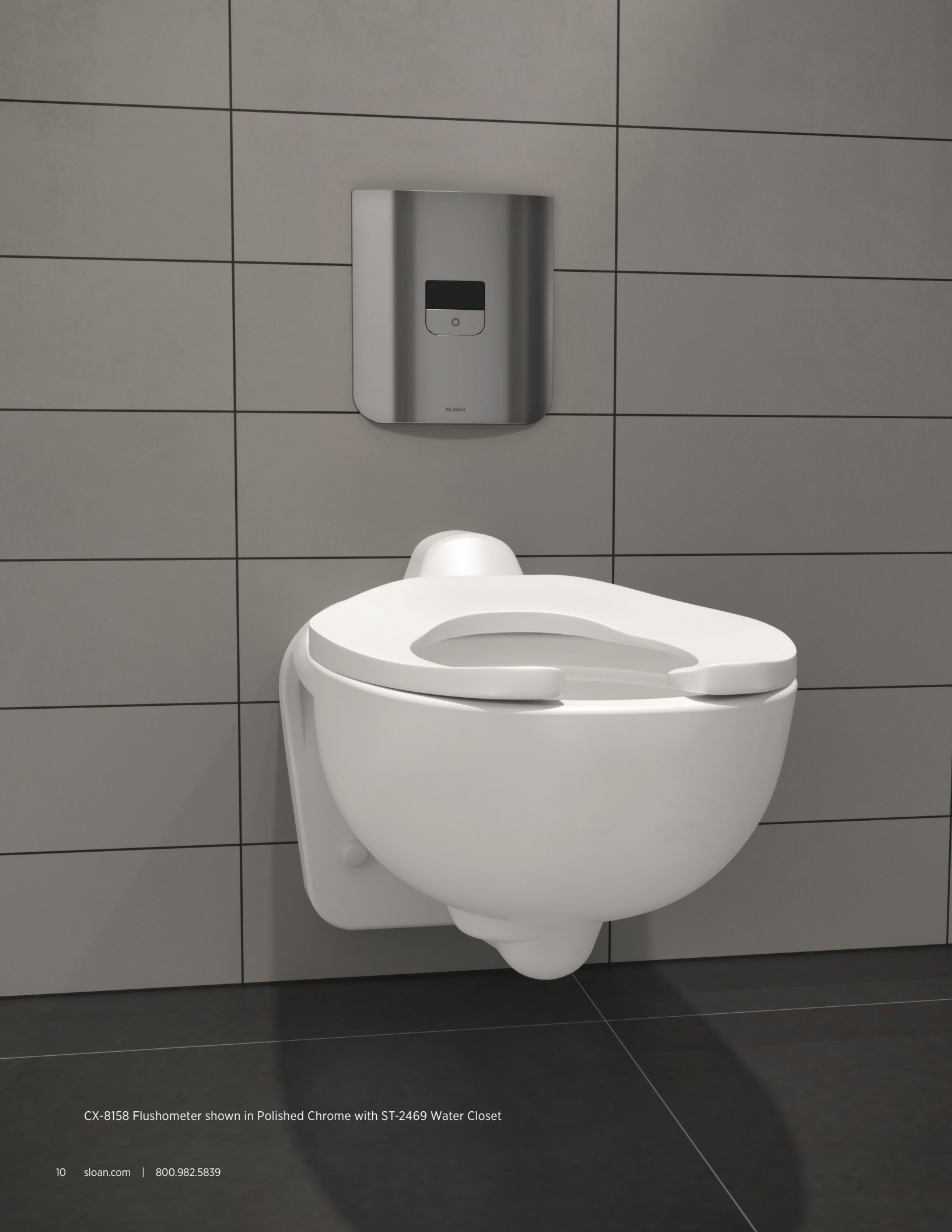
CX-8158 Flushometer shown in Polished Chrome with ST-2469 Water Closet