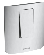
Brushed Stainless (SF)