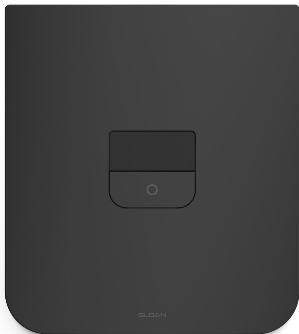
Matte Black (PVDMB)