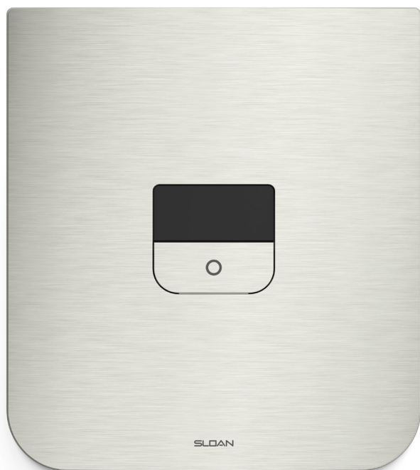
Brushed Nickel (PVDBN)