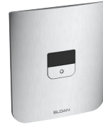
Brushed Stainless (SF)