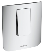
Polished Chrome (CP)