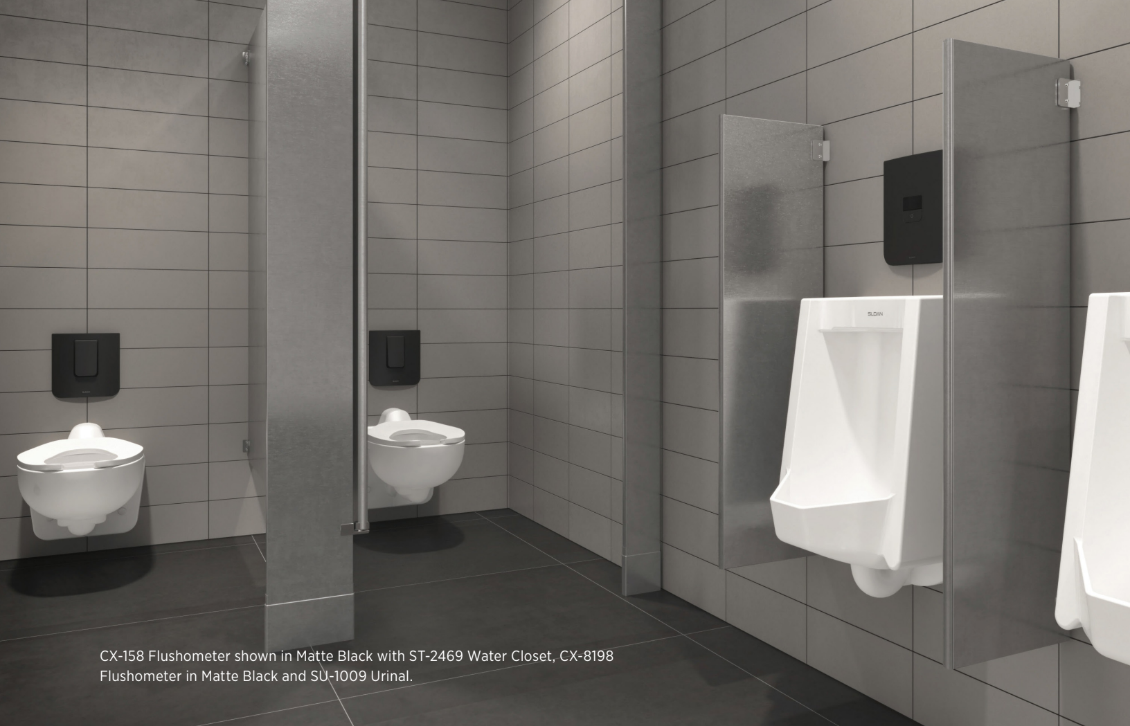
CX-158 Flushometer shown in Matte Black with ST-2469 Water Closet, CX-8198 Flushometer in Matte Black and SU-1009 Urinal.