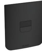
Matte Black (MB)