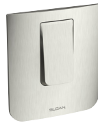
Brushed Nickel (BN)