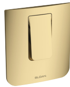
Polished Brass (PB)