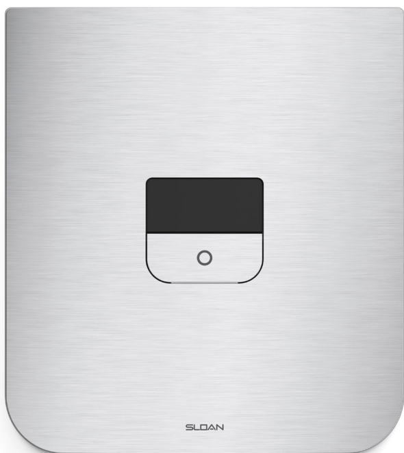
Brushed Stainless (PVDSF)