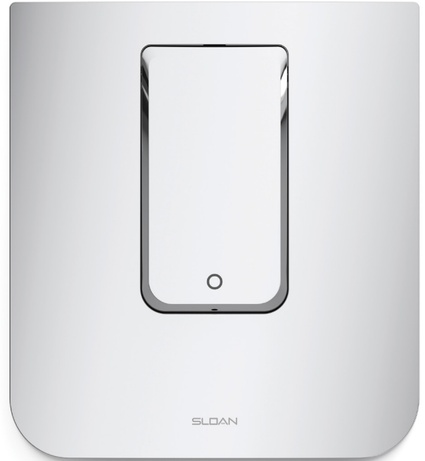
Manual in Polished Chrome (CP)

We've worked closely with architects and designers around the world to ensure that our efficient, water-saving products are also beautiful. With a choice of Polished Chrome or 4 attractive PVD finishes, including our newest color, Matte Black, the CX allows you to make the statement of your choice that elevates your restrooms.