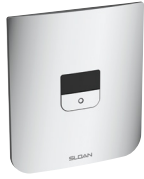
Polished Chrome (CP)