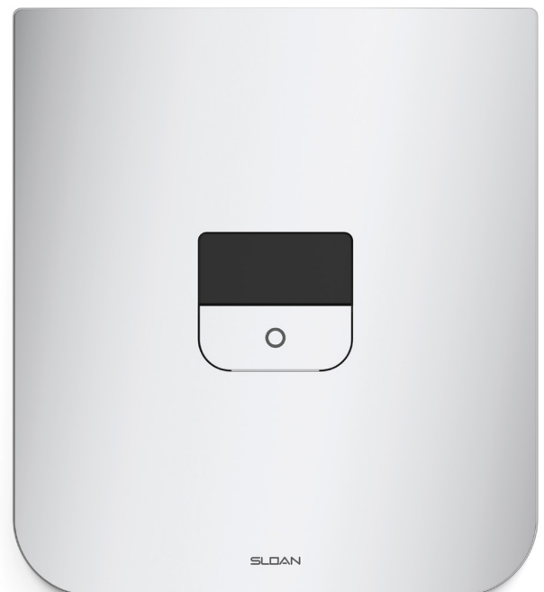
Sensor-Activated in Polished Chrome (CP)