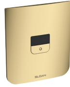
Polished Brass (PB)