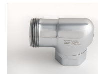
Patented TruStop Control Stop