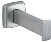
9314 Bradex® Towel Hook, projects 4¼" 9314-US Domestic