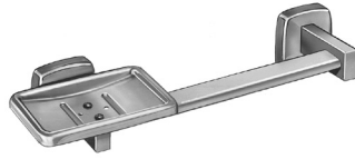
9034 Horizontal Towel Bar with Soap Dish, 10¼"W x 3½"D