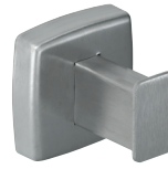
9114 Bradex® Single Robe Hook, projects 2" 9114-US Domestic