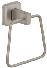
9334 Towel Ring, projects 2¾" 9334-US Domestic