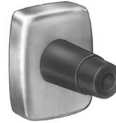
9144 DOOR STOP, PROJECTS 2½"