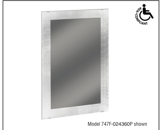
Model 747F-024360P shown