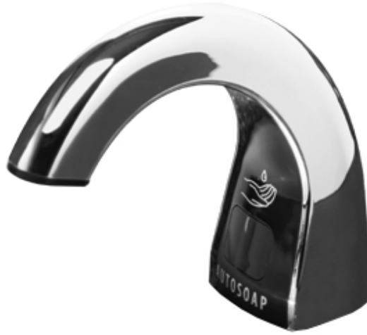
Shown in chrome #401310