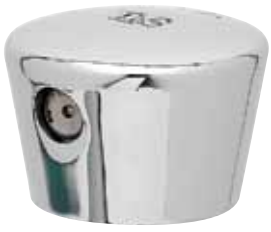
Push Button Metering