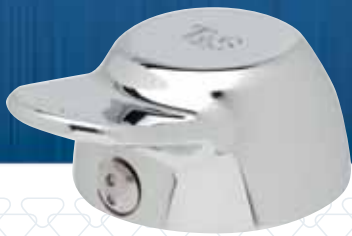
Pivot Action Metering